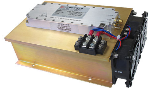
Option 072 Shown

The BBM4A5K7H (SKU 1041) is suitable for broadband high power linear applications, this amplifier module utilizes advanced GaAsFET power devices that provide high gain, wide dynamic range, low distortions and excellent linearity. Exceptional performance, long term reliability and high efficiency are achieved by employing advanced broadband RF matching networks and combining techniques, EMI/RFI filters, machined housings and qualified components. Empower RF's ISO9001 Quality Assurance Program assures consistent performance and the highest reliability.